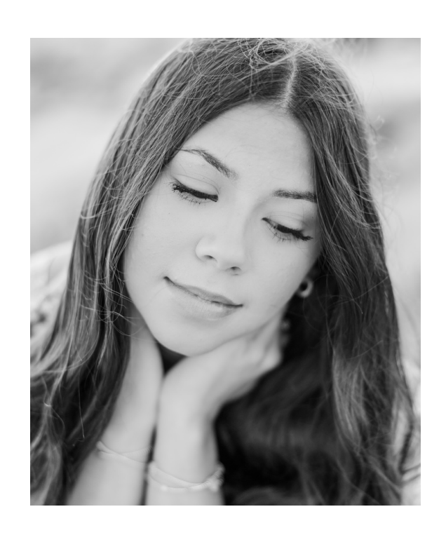
"A photograph in vibrant color reveals the essence of the moment as it appeared, while a black and white photograph unveils the depths of how it was truly felt."